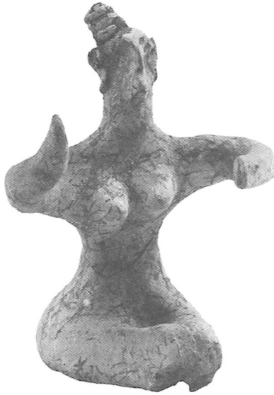
Figure 5: Sitting lady from Agia Triada, HM UNN.

Other sitting ladies have been found, for example in graves in that area (see e.g. Nilsson 1968: 296ff.).