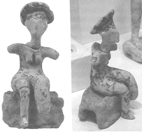
Figure 2: a) Figurine HM 16443, frontal. From Traostalos. b) Figurine HM 16443 side view.

In studying Aratos (ll. 188-196, 653-658, esp. the commentaries to those lines; Allen 1963: 142f, s.v. Cassiopeia) and the illustrated manuscripts of the Phenomena or other illustrations of that constellation, you will recognize the sitting lady with outstretched arms as Cassiopeia (many good pictures are available on the Internet s.v. Cassiopeia and then Pictures).