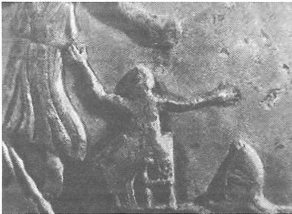
Figure 3: Cassiopeia on the Farnese atlas. Roman copy of a Hellenistic sculpture.

When we look for early pictures of the constellations, we find the Farnese Atlas which is a 2nd century Roman copy of a Hellenistic sculpture. It is the earliest complete map of the sky that we have and most likely is the earliest picture of the constellations with Cassiopeia positioned correctly amongst the other constellations.